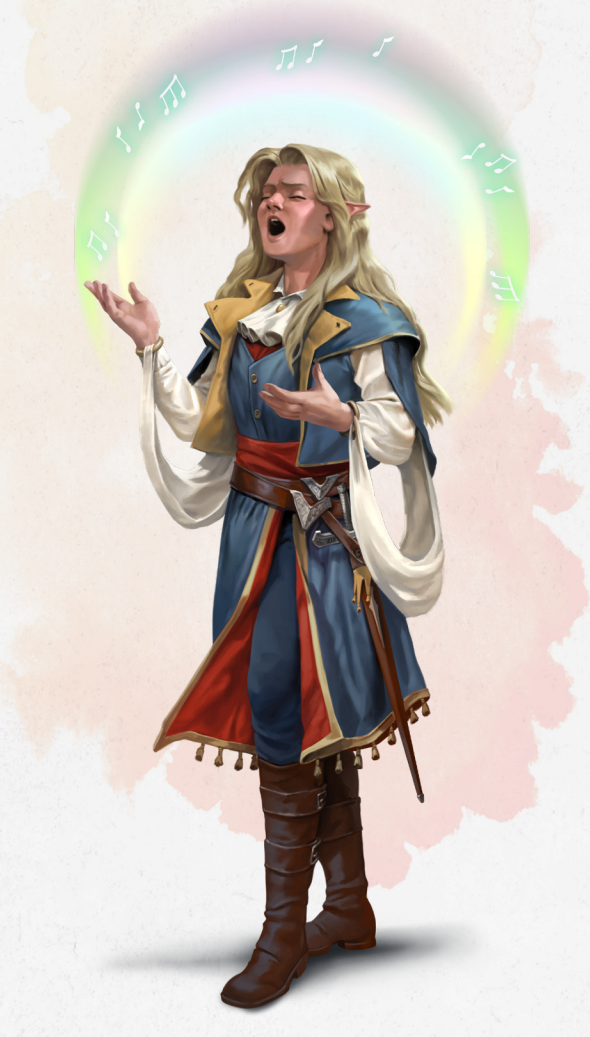
COLLEGE OF THE GRAND CHORUS