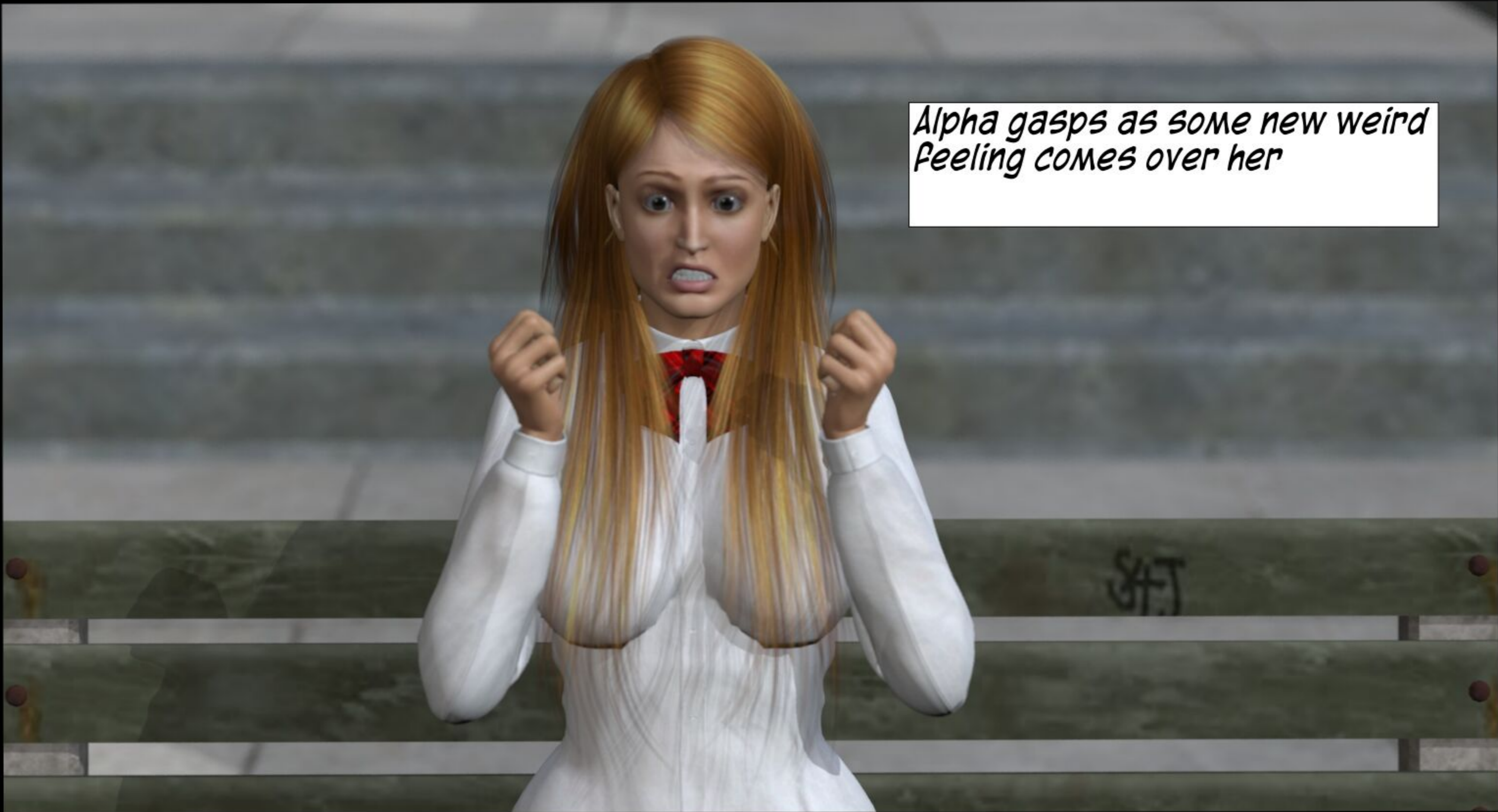
Alpha gasps as some new weird feeling comes over her