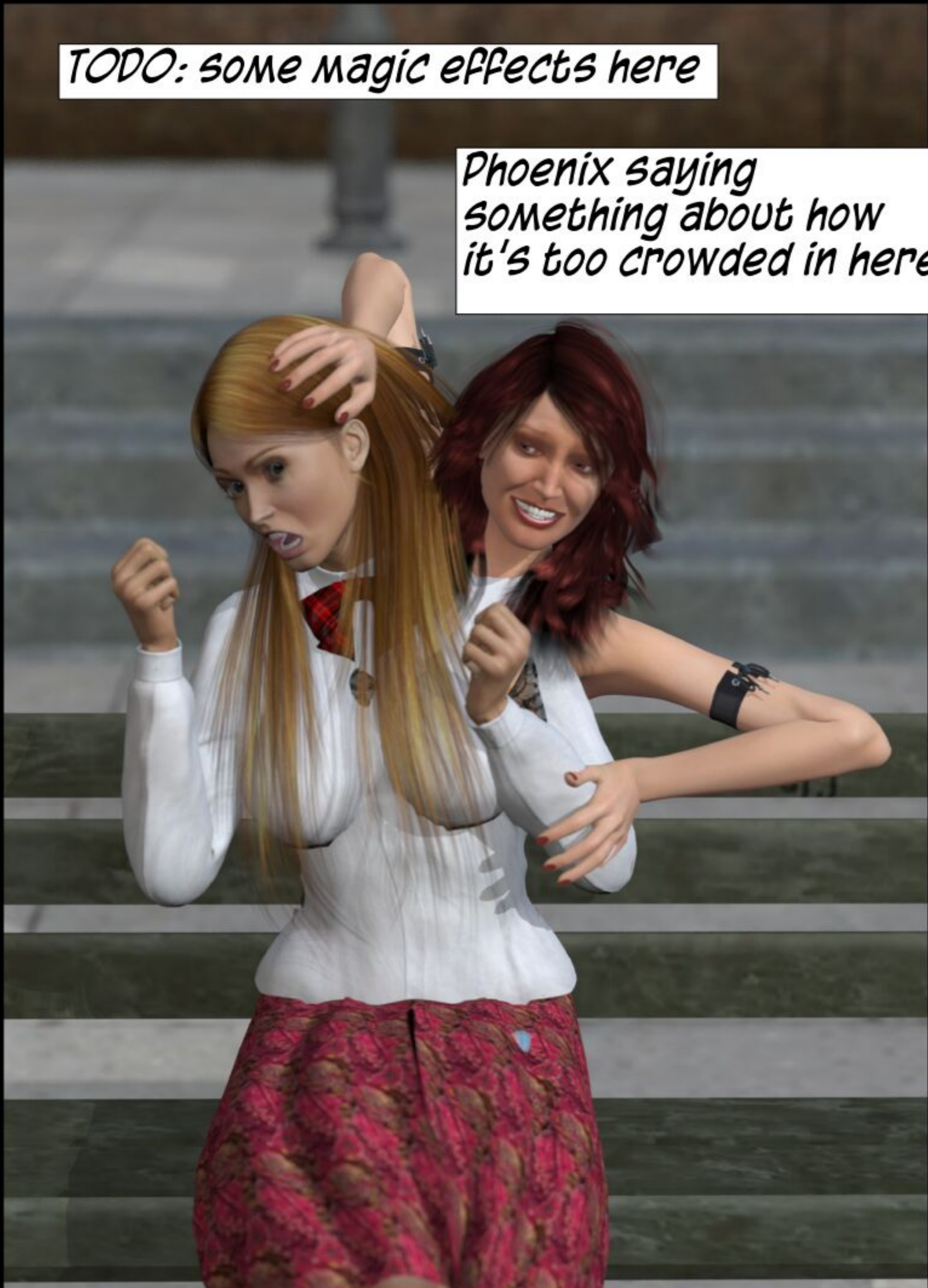
TODO: some magic effects here