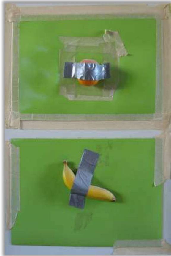
Figure 2: Banana and Orange

The two works are provided below, with Morford’s Banana & Orange (Figure 1) 1 on the left and Cattelan’s Comedian (Figure 2) 2 on the right: