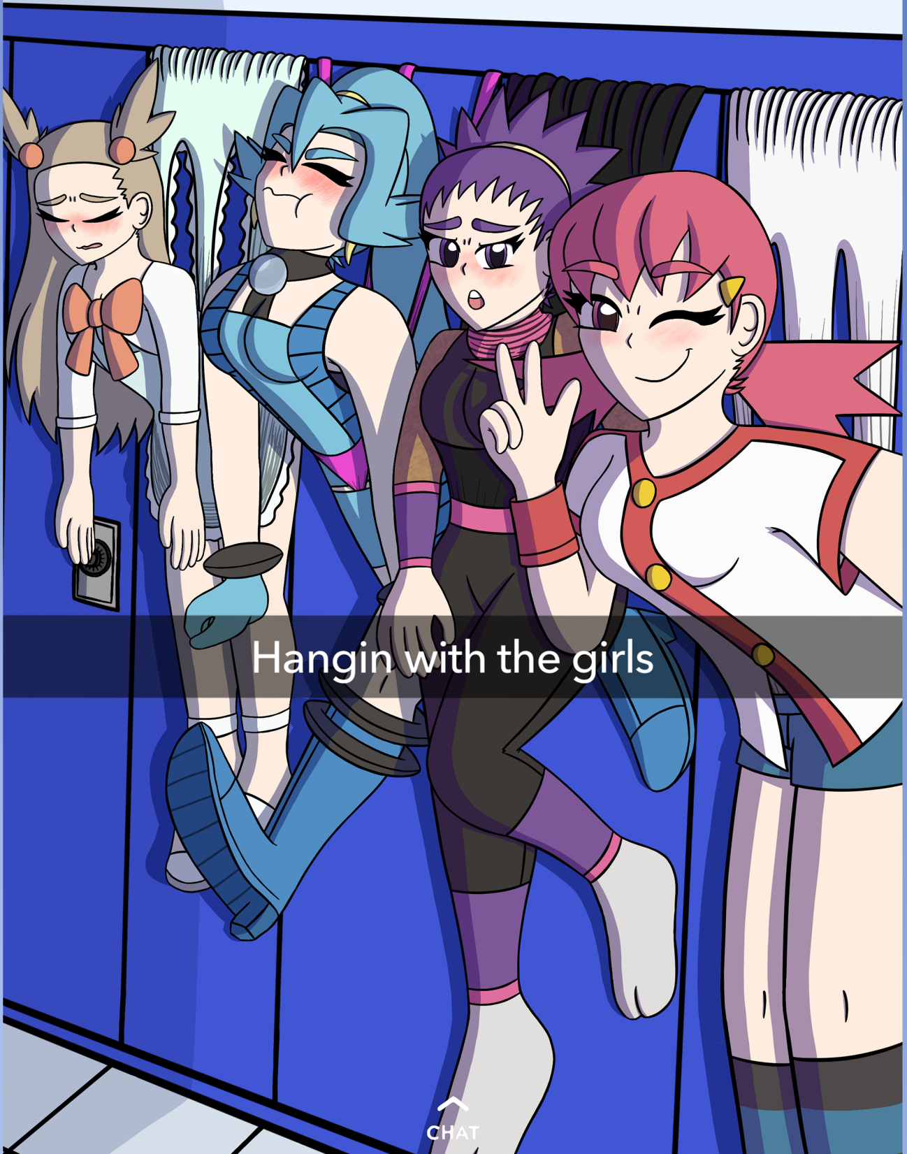
Hangin with the girls